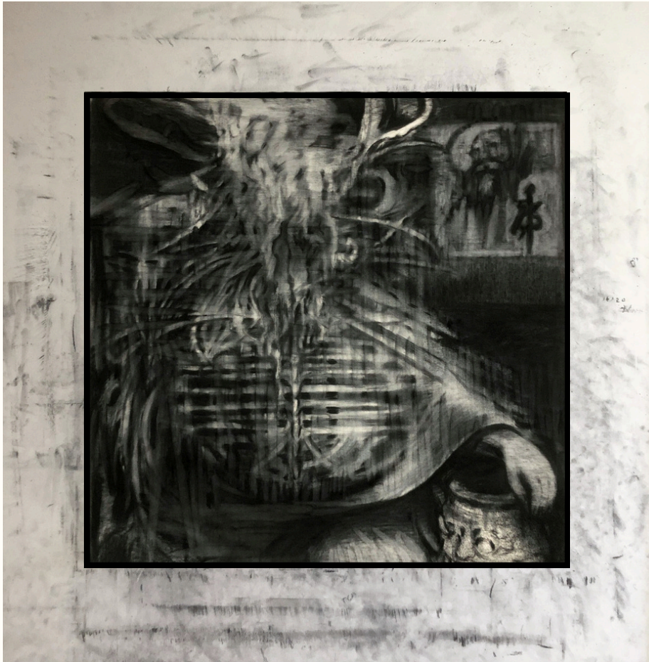
Transfiguration III, 2024