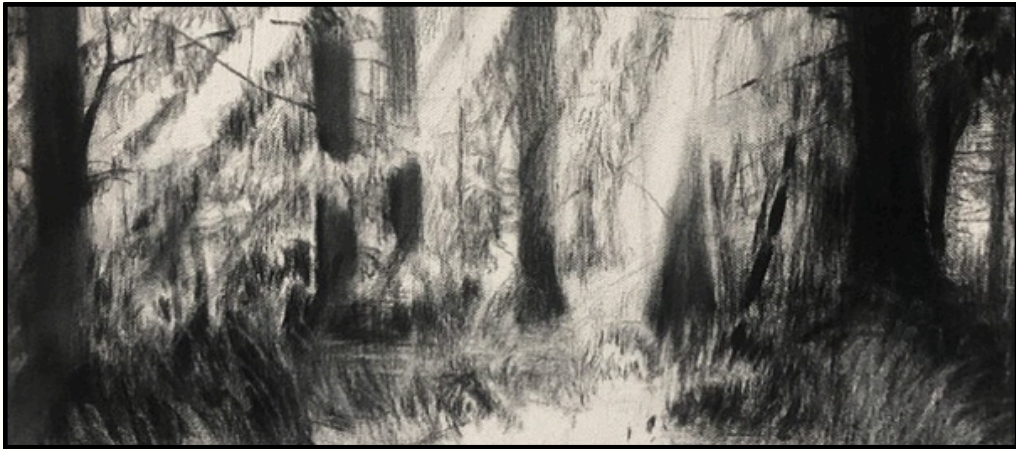
I Know a Spot , 2024 Charcoal on Raw Canvas 20in x 24in

Breathe in. A big breath. Feel your lungs fill to the brim with cool air. Feel the air push up to the top of your chest as you hold its weight. Hold it there long enough to feel your lungs start to sting, and when the heaviness of your chest begins to collapse, gently release it. Open your eyes and watch your breath as a single beam of light illuminates the soft dust in the air, pushing and pulling against the exhale of your breath, your eyes following the path of light downward until it lands gingerly on a bed of grass.